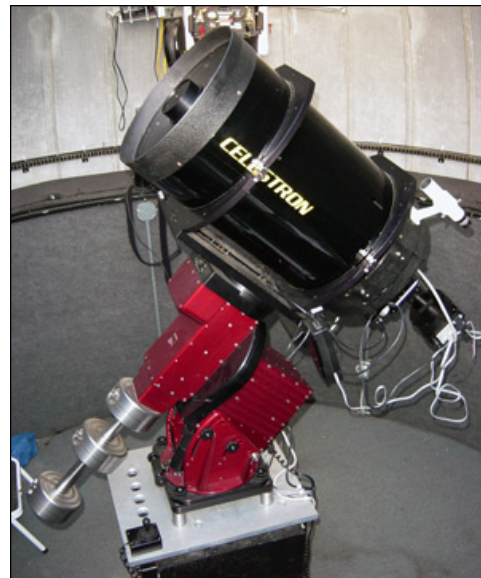
14-inch James & Evelyn Marron Telescope