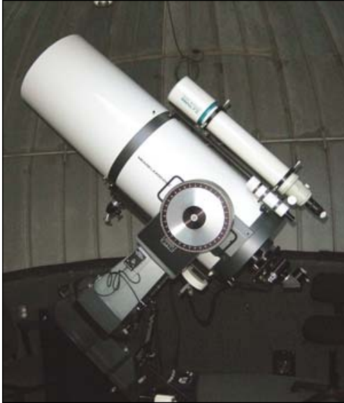
16-inch Jeffrey Borr Memorial Telescope

Since 1955, the Grand Rapids Amateur Astronomical Association (GRAAA) has been a leader in the promotion of astronomy in West Michigan. The GRAAA welcomes members of all ages and interest levels, from the casual observer to the telescope owner who observes at every opportunity.